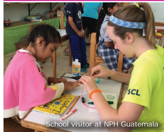
School visitor at NPH Guatemala